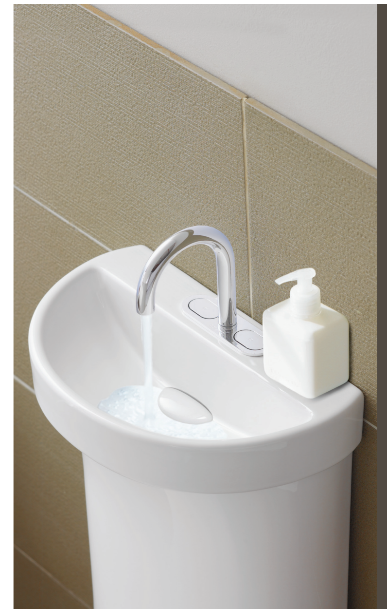
Profile™ Toilet Suite with Integrated Hand Basin available mid-2007